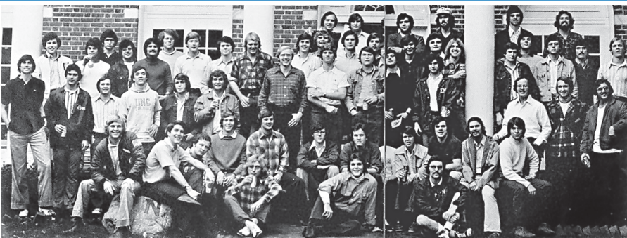
In this picture: Sigma Nu brothers in 1974. From Yackety Yack.

We love coming across great old pictures from our chapter's history, and need your help to build up our archives on our new web site! Please share the best pictures from your era with us. You can upload them at www.uncsigmanu.com , or email them to our editors at content@affinityconnection.com .